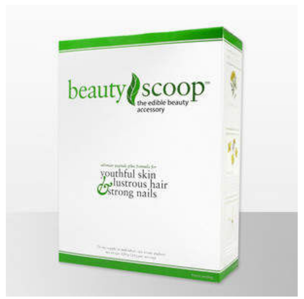
A box of BeautyScoop contains a 21 day supply!

Description: BeautyScoop is an edible doctor-developed, clinically proven, safe and effective whole body beauty infusion, that boosts the body's own regenerative power to reduce the appearance of fine lines and wrinkles, add shine to hair and strengthen nails. In clinical studies, 86% of users reported improvement of their skin, hair and nails - all three areas- within 3 weeks! BeautyScoop is natural and vegetable-based, and made in a US at an organic-certified factory. As a pure powder for maximum absorption, BeautyScoop can be mixed into any beverage - hot or cold - to provide rapid and long-lasting results.